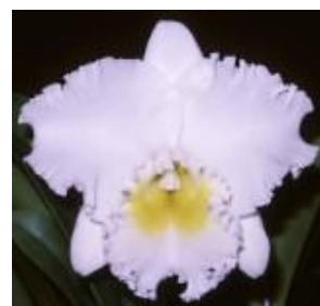
Figure 2 Rlc Burdekin Dream "DJ" FCC/AOC